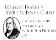
Benjamin Franklin American Inn of Court